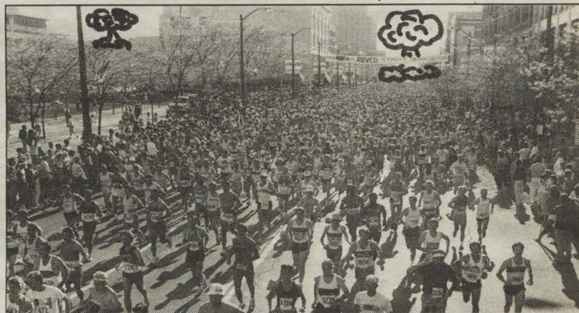
Hundreds of thousands of Soviets flee from accidental bombing in Moscow.

The Reagans could only comment, "well..." about the disaster.