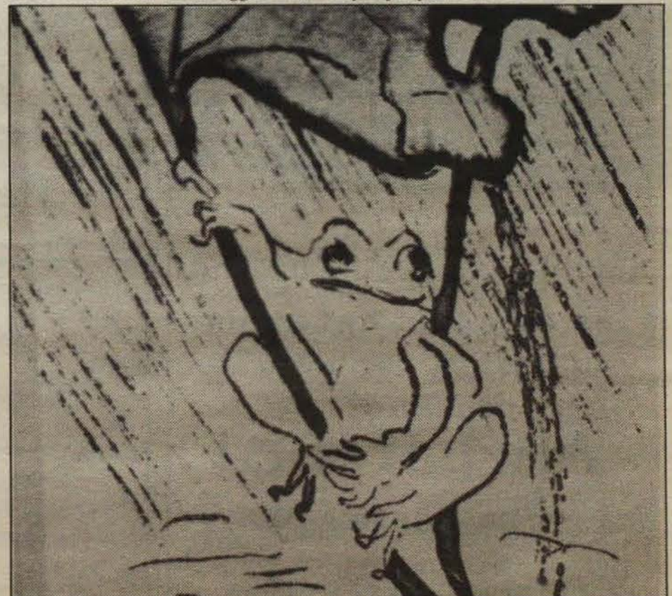
A deadly African lily frog is just one of the dangers the students must face.