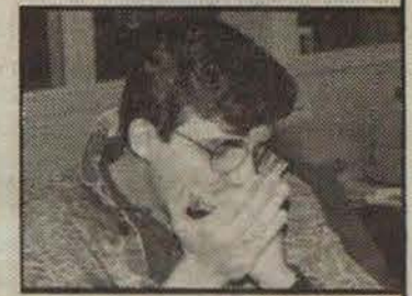
"Playing the blues in prison."