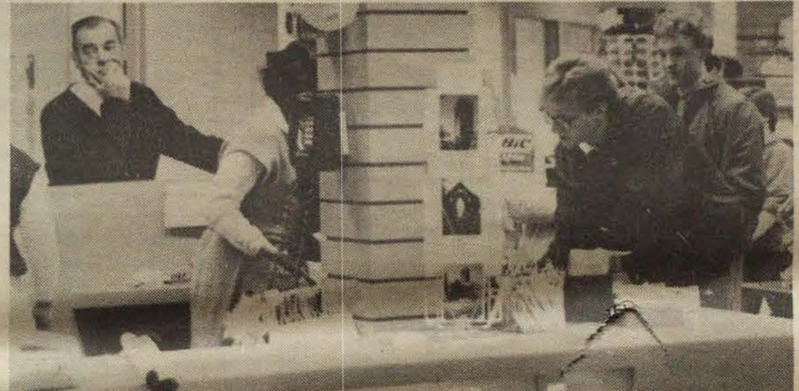
THE BUCKS STOP HERE — Students dish out their life savings at bookstore rush.

Because the fire was out of the way and of such a small size, no one would have been endangered, even during a dinner rush, just given a little excitement in their lives.