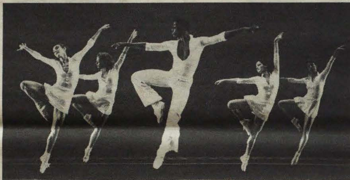
ON THEIR TOES — "Les Ballet Jazz de Montreal" will jazz up ballet in Kulas next Saturday.

Tickets range in price from $5 to $9.50 and if you are a John Carroll student, when you purchase one ticket, you get another one free. Other discounts are also available for senior citizens and groups of 15 or more. For more info, call the box office at 491-4428.