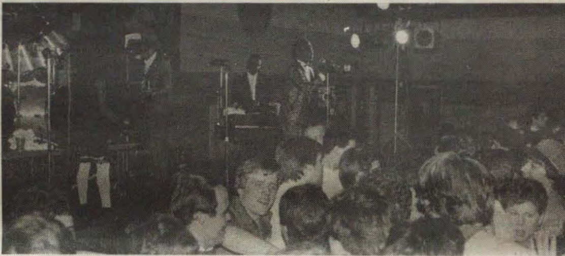
SHOUT IT OUT — Otis Day and the Knights took a gymful of sheet-wrapped dancers and 'made 'em wanna shout' Saturday night.