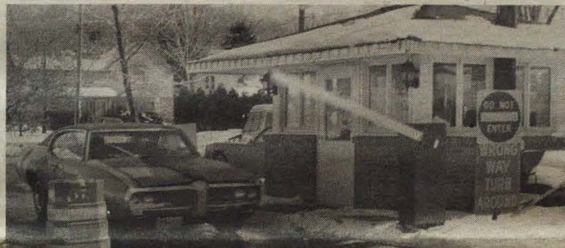
CHECKPOINT — As a new security measure, the gate at the Belvoir guardhouse is now operated even on weekends.