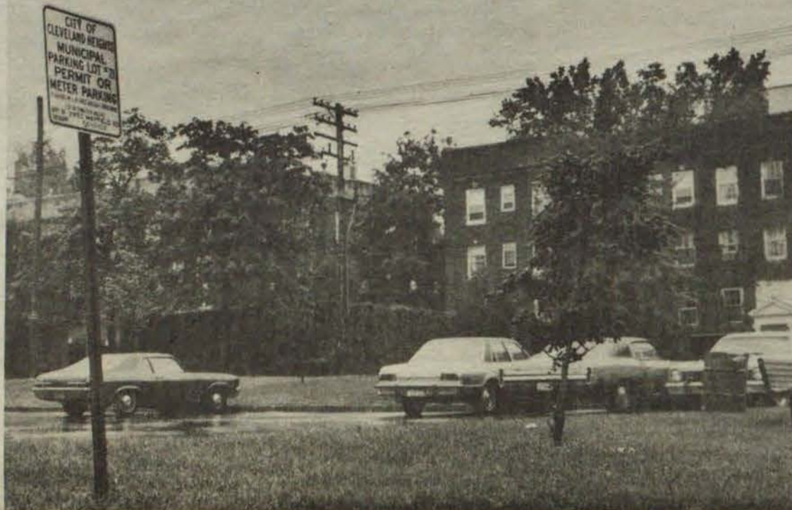
The necessity of parking illegally was, until recently, one of the major problems for commuters in the University apartments.

spacious private bedroom, I can come downstairs to a delicious home-cooked meal. After dinner, I might hop in the car, pick up some friends, and head out for the evening. Returning home, I can jump into a hot bubble bath in the privacy of my own bathroom. Soon after, I will slip in between the sheets of my very own bed, and fall fast asleep. Ahhh — the joys of commuting.