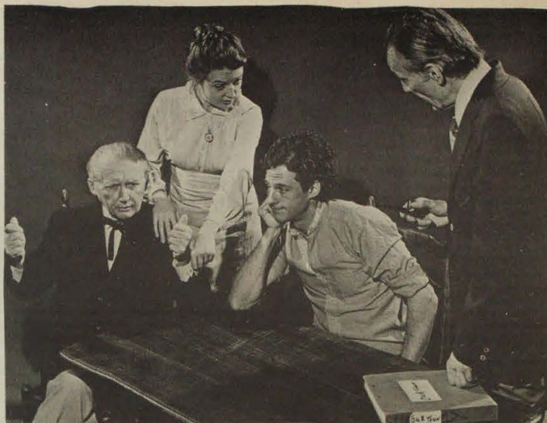
"Cleveland on Stage" will present the Great Lakes Shakespeare Festival production of Thornton Wilder's "Our Town" twice tomorrow evening in Kulas Auditorium-including an experimental 11 p.m. late show. There will also be a 7:30 p.m. curtain. Tickets at $1.50 for students are available at the door.