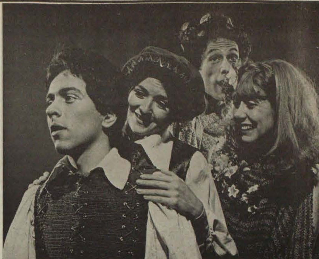
This scene with Orlando, Rosalind, Silvius, and Phebe is part of the Great Lakes Shakespeare Festival production of Shakespeare's comedy "As You Like It." The play is part of the Cleveland On Stage series to be presented tonight in Kulas Auditorium.

Do not let these next few weeks of good weather go by without seeing the other side of Cleveland.