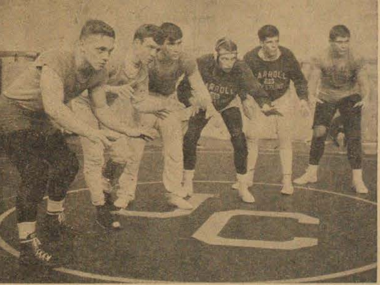
SIX STREAK WRESTLERS show that they are ready for Thiel, Allegheny and Bethany.

Ruminski's current performance during the past week represents a bright spot in Carroll's hopes for continuing the current winning