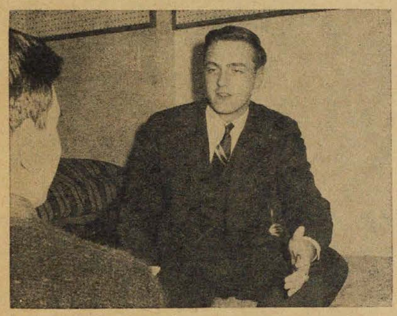
Bush explains his platform to a prospective supporter.