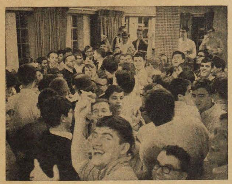
Murphy's Army gathers for refreshments after a tiring rally.