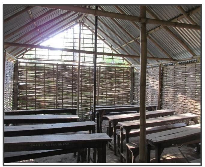
Figure 3 A high school classroom in Beldangi Camp 1

Nepal's school was out on its only break for the year, but we were fortunate enough to run into the principal and assistant principal while "trespassing" and taking