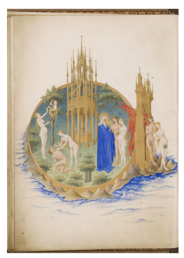
Fig. 1. The Limbourg Brothers, the Très Riches Heures , folio 25v.

likely created with the express intention of stimulating the Duke's desires in multiple and even contradictory ways.