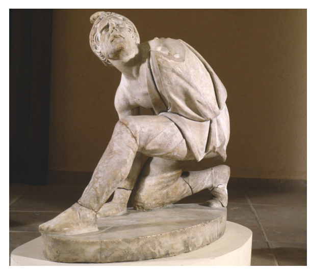
Fig. 3. Defeated Persian, Roman copy of a Greek sculpture of ca. 200 BCE (Musée Granet, Ville d'Aix-en-Provence;).

There, we read in Latin and French that when one obeys the will of the Devil one becomes entwined by the mouth, the neck, the loins, the limbs, and the feet.<sup>30</sup> In this formulation of embodiment, sin moves downward from the head toward the feet. In the image of Adam, we see virtually all of these body parts as well as his orifices, all caught unaware and about to be entrapped by the devil, a striking visualization of the fallen body.