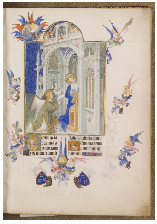
Fig. 2. The Limbourg Brothers, the Très Riches Heures , folio 26r.

to be undone by Christ's coming into the world to die. Nevertheless, the combination of these two images at the start of the Hours of the Virgin is unusual at this time—but not unprecedented.<sup>25</sup>