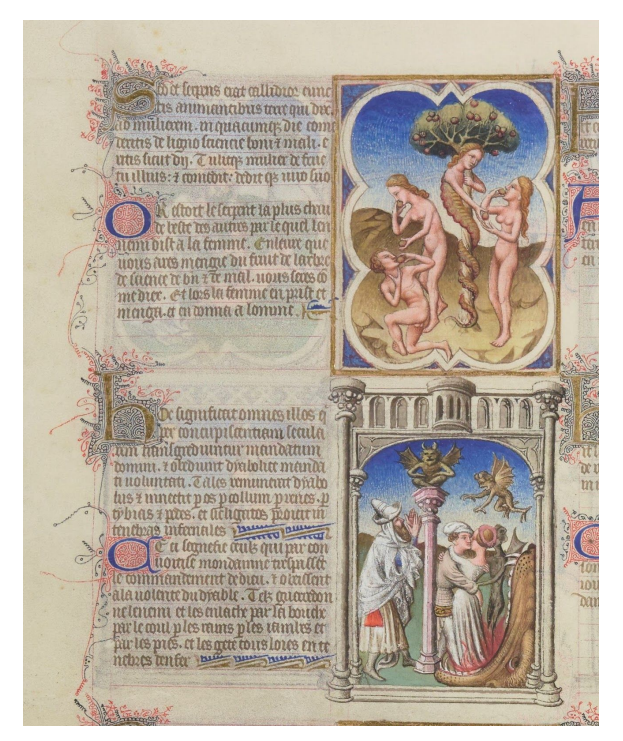
Fig. 4. The Limbourg Brothers, Bible moralisèe , folio 3v (detail) (image provided by the Bibliothèque nationale de France).

The text passage from the moralized Bible that was referenced above was found in the manuscript painted by Pol and Jean, but the formulation can be traced back to the earliest surviving moralized Bible (Vienna, ÖNB, codex 2554), a royal manuscript of ca. 1220 (Fig. 5). In this manuscript, the devil's ensnarement of the fallen body is linked to same-sex desire in an image of two same-sex couples, one female and one male. This representation of sodomitical sex has been much reproduced by scholars in recent decades and is given extended analysis by Robert Mills in his recent book on the visualization of sodomy in the Middle Ages.<sup>32</sup> Mills situates this image in the context of anti-sodomitical discussions that would have been familiar to