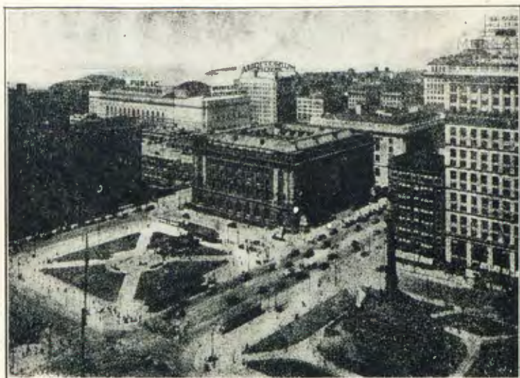
An Aerial View