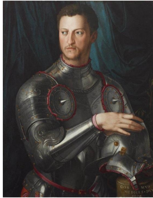
Figure 19. Bronzino. Portrait of Cosimo I de' Medici in Armor , 1545. Oil on panel. 86 x 67cm. Art Gallery of New South Wales, Sydney. 78.1996.