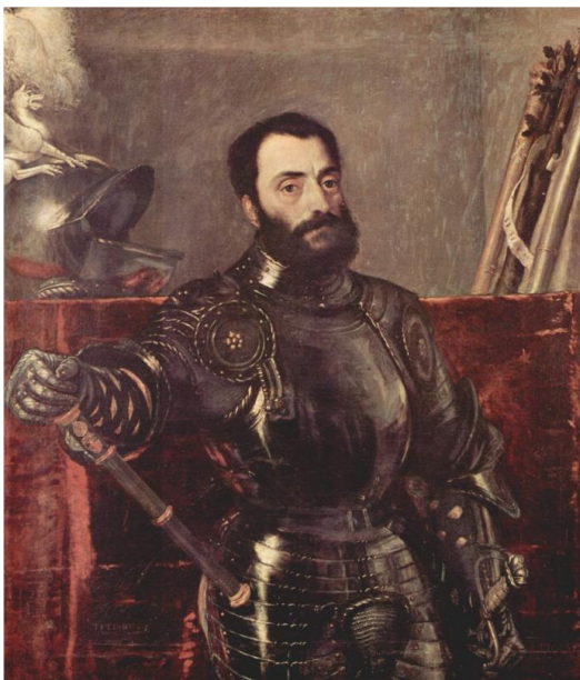
Figure 18. Titian, Portrait of Francesco Maria della Rovere , 1536-1538. Oil on canvas, 114 x 100 cm. Galleria degli Uffizi, Florence.