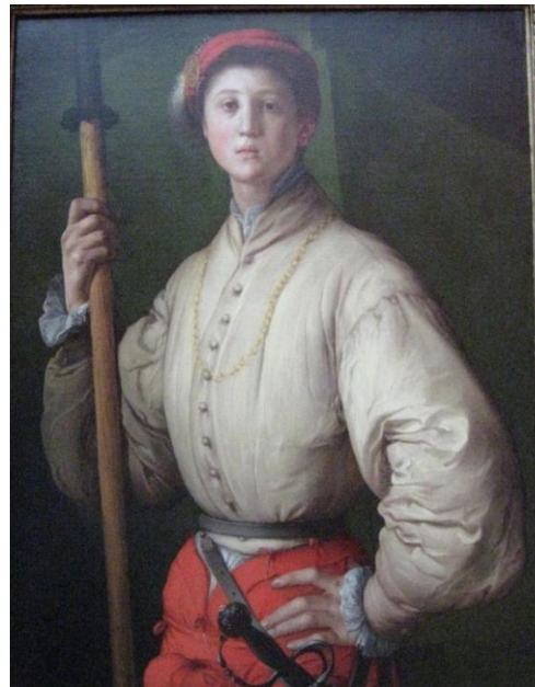
Figure 13. Pontormo, Portrait of a Halberdier , c. 1529-30 or c. 1537. Oil on panel transferred to canvas, 92 x 72 cm. J. Paul Getty Museum, Los Angeles.