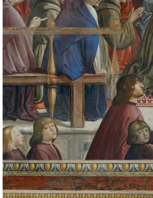
Figure 8. Domenico Ghirlandaio, The Confirmation of the Rule of the Franciscan Order (Detail) , c. 1483. Fresco. Sassetti Chapel, Santa Trinità, Florence.