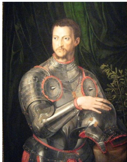
Figure 20. Workshop of Bronzino, Portrait of Cosimo I de' Medici in Armor , 1545. Oil on wood, 101 x 77 cm. The Toledo Museum of Art.