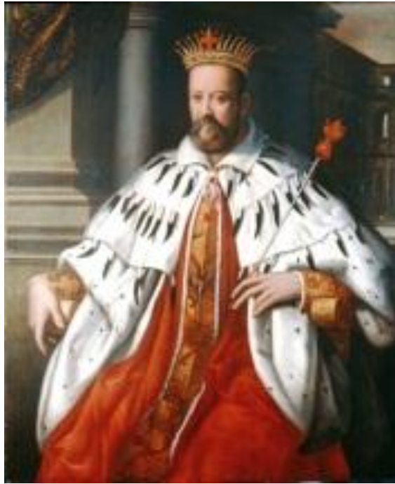
Figure 28. Giovanni Battista Naldini, Cosimo I de' Medici (as Grand Duke), 1585. Oil on canvas, 140 x 216 cm. Galleria degli Uffizi, Serie Aulica, Florence.