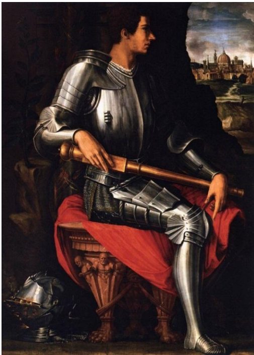
Figure 11. Giorgio Vasari, Portrait of Alessandro de' Medici , 1533-1534. Oil on panel. Galleria degli Uffizi, Florence.