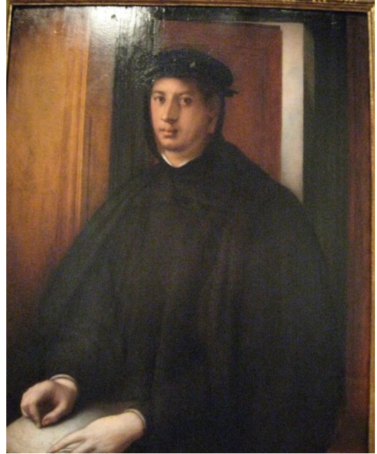
Figure 12. Pontormo, Portrait of Alessandro de' Medici, 1534-1535. Oil on panel, 101.3 x 81.9 cm. Philadelphia Museum of Art.