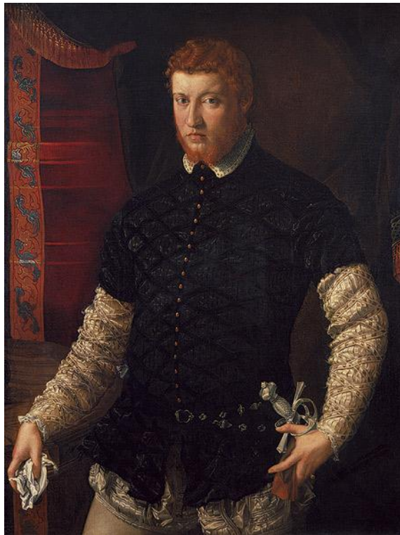
Figure 22. Francesco Salviati, Portrait of a Man . Oil on Canvas, 123 x 93 cm. Metropolitan Museum of Art, New York.