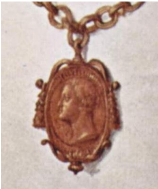
Figure 15a. Bronzino, Portrait of Bia de' Medici (Detail of medal obverse) , c. 1542. Tempera on panel. Galleria degli Uffizi, Florence