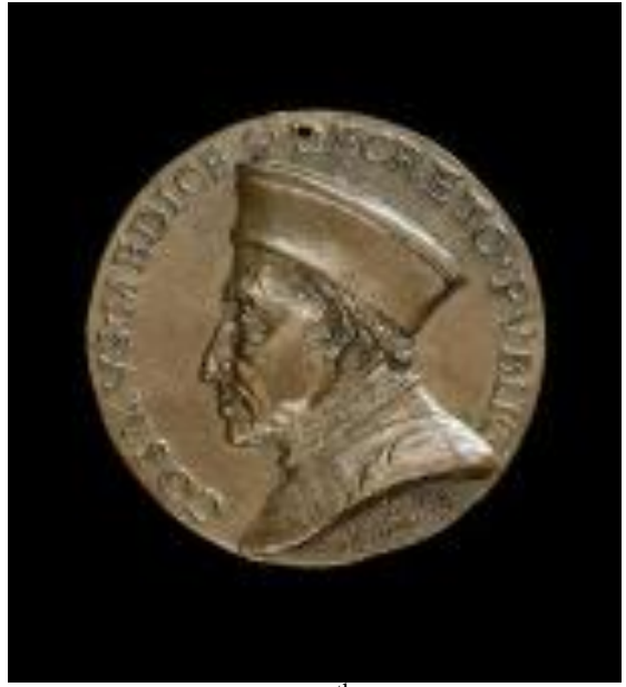
Figure 4. Florentine 15 th Century, Cosimo de' Medici , c. 1465-1469. Bronze Medal, Diameter 7.8 cm. National Gallery of Art, Washington D.C. 1957.14.840.a