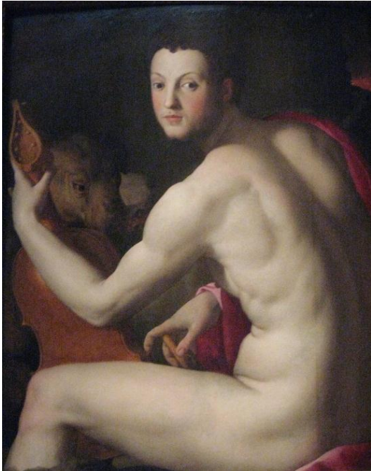
Figure 14. Bronzino, Cosimo I as Orpheus, c. 1537-1539. Oil on Wood, 93.7 x 76.4 cm. Philadelphia Museum of Art.