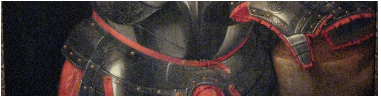
Figure 20a. Workshop of Bronzino, Portrait of Cosimo I de' Medici in Armor (Detail), 1545. Oil on panel. The Toledo Museum of Art.