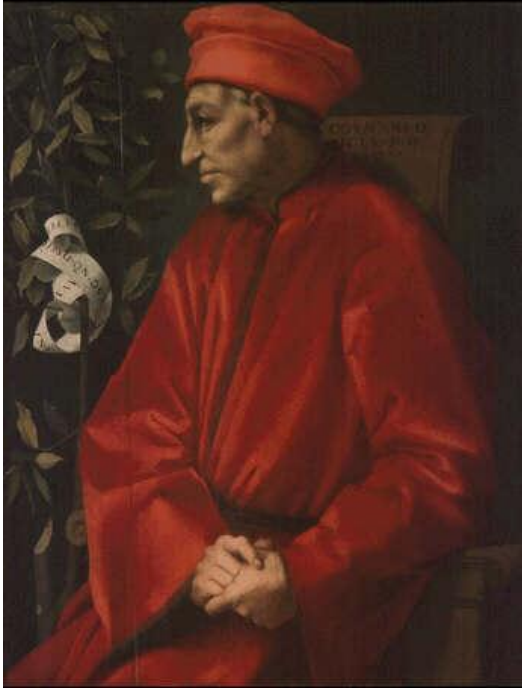
Figure 10. Pontormo, Portrait of Cosimo de' Medici , c. 1519-1521. Oil on panel, 90 x 72 cm. Galleria degli Uffizi, Florence. Inv. 1890, no. 3574.