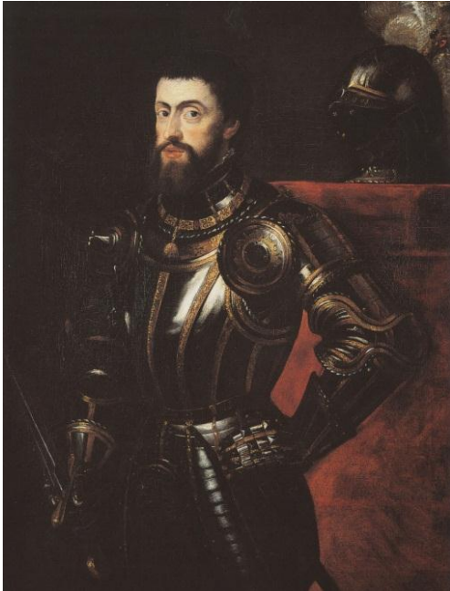
Figure 17. After Titian, Portrait of Emperor Charles V in with Drawn Sword , c. 1600-1605. Oil on canvas, 119 × 62 cm. Private collection, England.