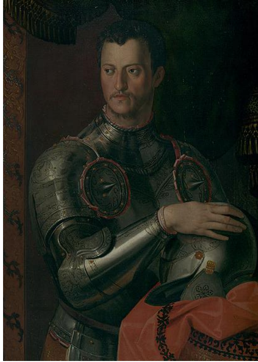
Figure 21. Workshop of Bronzino, Portrait of Cosimo I de' Medici in Armor , c. 1545. Oil on wood, 95.9 x 70.5 cm. Metropolitan Museum of Art, New York.