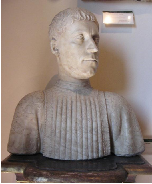
Figure 2. Mino da Fiesole, Piero di Cosimo de' Medici. c. 1453-1454. Marble. Museo Bargello, Florence. Inv. Marmi 1879, no. 75.