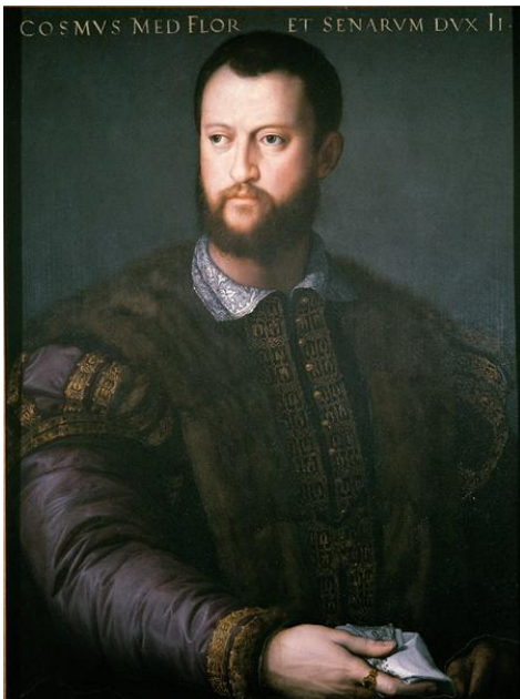
Figure 25. Workshop of Bronzino, Cosimo I de' Medici (at age 40), c. 1560. Oil on panel, 82 x 68 cm. Galleria Sabauda, Turin.