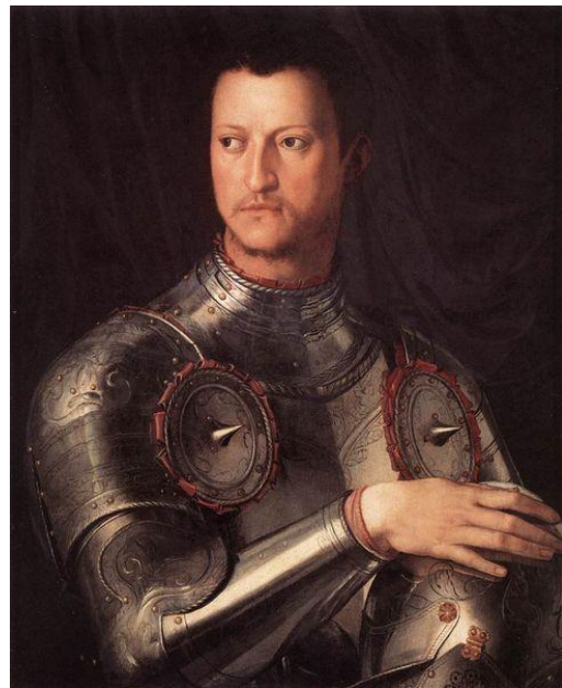
Figure 16. Bronzino, Portrait of Cosimo I de' Medici in Armor , c. 1543. Tempera on Panel, 74 x 58 cm. Tribuna della Galleria degli Uffizi, Florence. Inv. 1890, no. 855