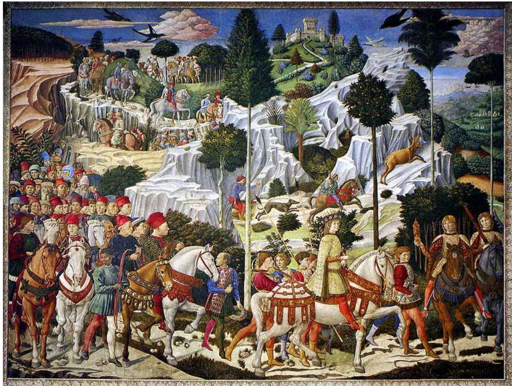
Figure 1a. East Wall