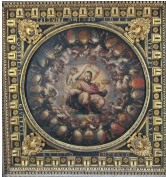
Figure 29. Vasari, Apotheosis of Duke Cosimo de' Medici , c. 1565. Oil on Wood. Sala Grande del Cinquecento in the Palazzo Vecchio, Florence.