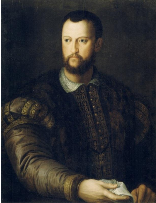
Figure 24. Workshop of Bronzino, Cosimo I de' Medici (at age 40), c. 1560. Oil on panel, 84 x 66 cm. Galleria Borghese, Rome.