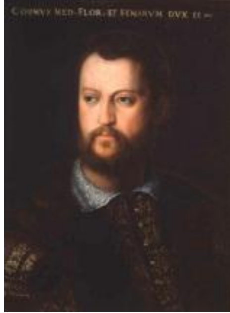
Figure 26. Cristofano dell'Altissimo (after Bronzino), Portrait of Cosimo I de' Medici, Grand Duke of Tuscany , c. 1562-1565. Oil on panel, 58 x 44 cm. Galleria Palatina, Palazzo Pitti, Florence.