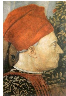
Figure 1b. Cosimo Figure 1c. Lorenzo, Giuliano, Pius II, and artist Figure 1d. Piero