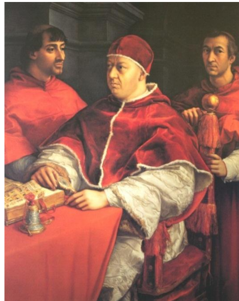
Figure 9. Raphael, Leo X with Cardinals Giulio di' Medici and Luigi de' Rossi , 1518. Tempera on Wood, 154 x 119 cm. Galleria degli Uffizi, Florence.