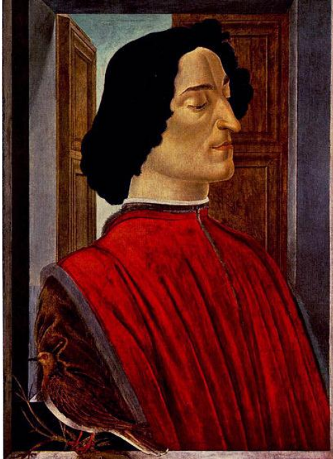
Figure 6. Botticelli, Giuliano de' Medici , c. 1478-1480. Tempera on panel, 75.5 x 52.5 cm. National Gallery of Art, Washington D.C.