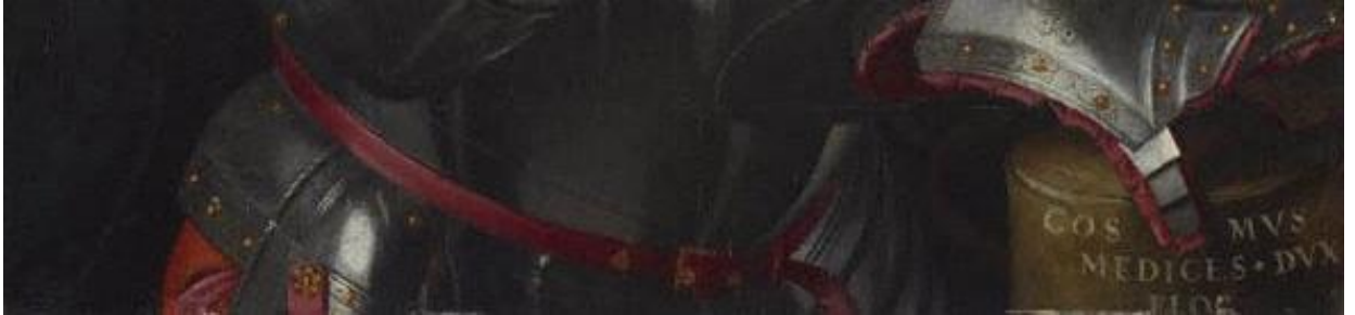
Figure 19a. Bronzino, Portrait of Cosimo I de' Medici in Armor (Detail), 1545. Oil or tempera on Panel. Art Gallery of New South Wales, Sydney. 78.1996