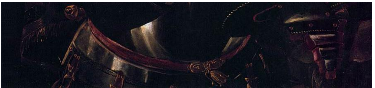
Figure 23. Workshop of Bronzino, Portrait of Cosimo I de' Medici in Armor (Detail), c. 1545. Oil or tempera on panel. Gemäldegaleri Alte Meister, Kassel, Germany.