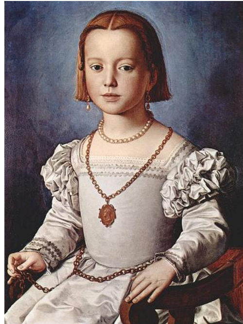
Figure 15. Bronzino, Portrait of Bia de' Medici (Wearing a Medal of Cosimo I) , c. 1542. Tempera on panel, 63 x 48 cm. Galleria degli Uffizi, Florence.