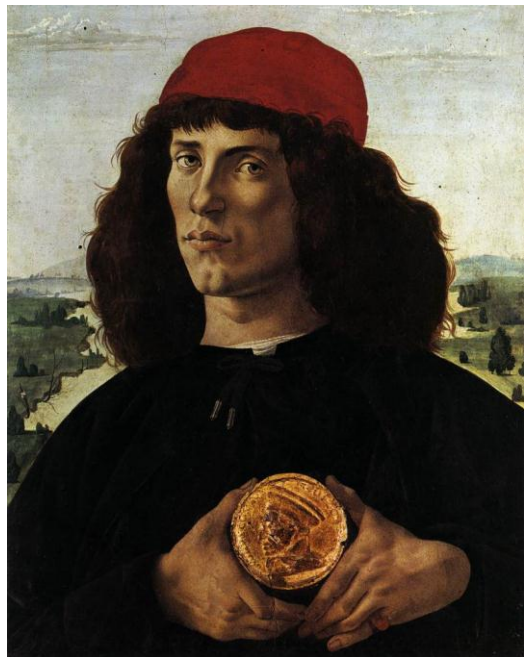
Figure 5. Botticelli, Portrait of a Man Holding Medal of Cosimo de' Medici , c. 1475. Tempera on panel. Gilded stucco for the Medal. Galleria degli Uffizi, Florence.