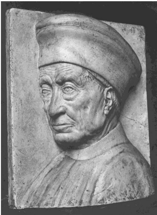
Figure 3. Workshop of Antonio Rossellino, Cosimo de' Medici , c. 1460-1465. Marble relief, 36 x 32 cm. Staatliche Museen zu Berlin. Inv. No. 124.