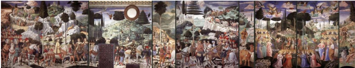
Figure 1. Benozzo Gozzoli, The Journey of the Magi , 1459. Palazzo Medici, Florence.