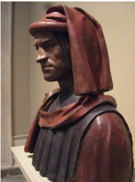
Figure 7. Florentine 15 th or 16 th Century (After Verrocchio), Lorenzo de' Medici , 1478/1521. Painted terracotta. National Gallery of Art, Washington D.C.