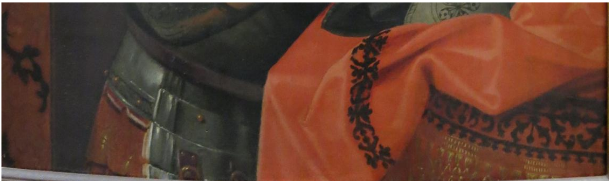
Figure 21a. Workshop of Bronzino, Portrait of Cosimo I de' Medici in Armor (Detail), c. 1545. Oil on panel. Metropolitan Museum of Art, New York.