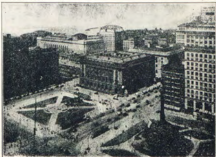
An Aerial View