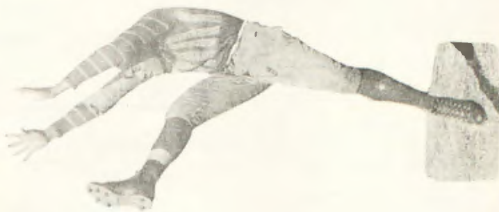
ARCHIE LEWIS, Halfback