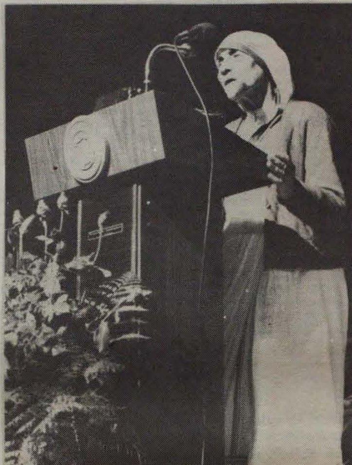
Mother Teresa of Calcutta

Her moving acceptance speech brought some of the crowd to tears. She asked the crowd to "give of themselves until it hurt," stressing prayer, sacrifice and poverty, in imitation of Jesus Christ. She called the poor great people, saying "In the name of the poor, the unwanted, the unloved, and forgotten human beings, I accept this honorary degree. You give it to me in recognition of the poor."